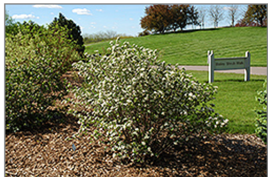
Autumn Magic Black Chokeberry in bloom