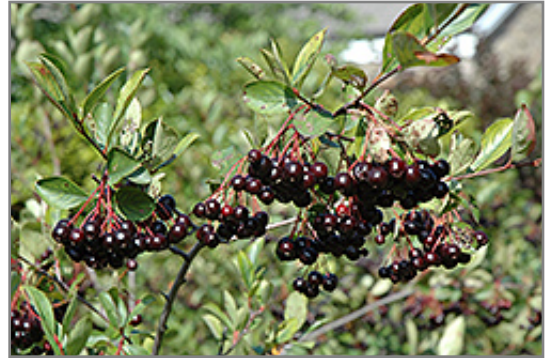
Autumn Magic Black Chokeberry fruit

This shrub should only be grown in full sunlight. It is an amazingly adaptable plant, tolerating both dry conditions and even some standing water. It is not particular as to soil type or pH, and is able to handle environmental salt. It is somewhat tolerant of urban pollution. This is a selection of a native North American species.