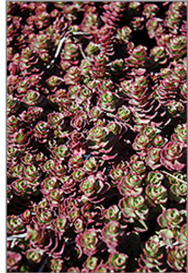
Red Carpet Stonecrop foliage