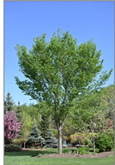
Brandon Elm