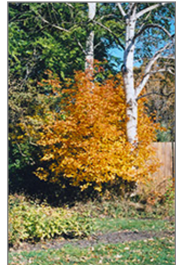
Saskatoon in fall