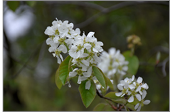
Saskatoon flowers

Saskatoon is a multi-stemmed deciduous shrub with an upright spreading habit of growth. Its relatively fine texture sets it apart from other landscape plants with less refined foliage.