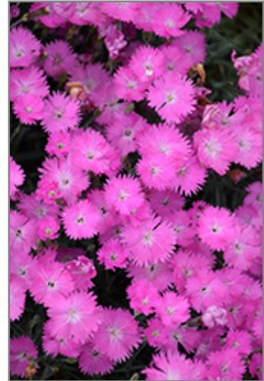
Firewitch Pinks flowers

Firewitch Pinks is recommended for the following landscape applications;