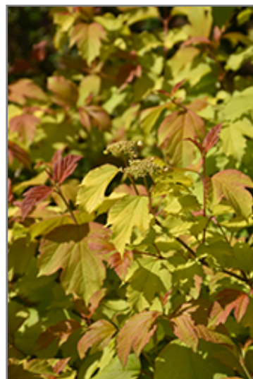
Oh Canada Cranberry Bush foliage