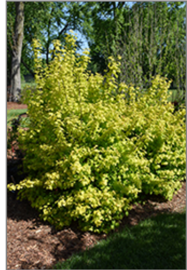
Oh Canada Cranberry Bush

* This is a 'special order' plant - contact store for details