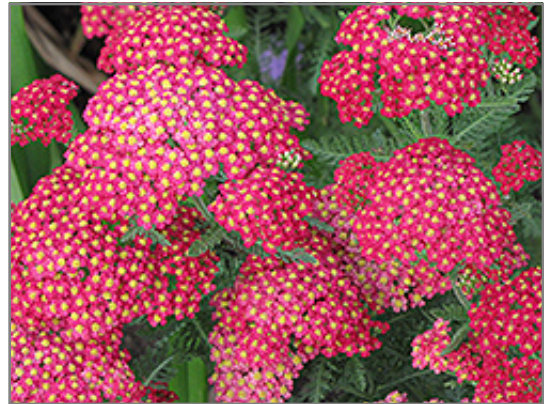
Galaxy Paprika Yarrow flowers

Galaxy Paprika Yarrow is recommended for the following landscape applications;