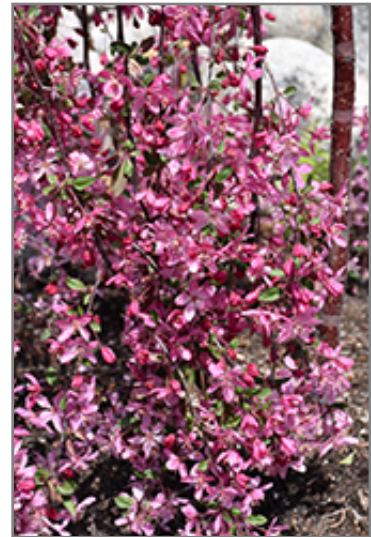
Royal Beauty Flowering Crab flowers