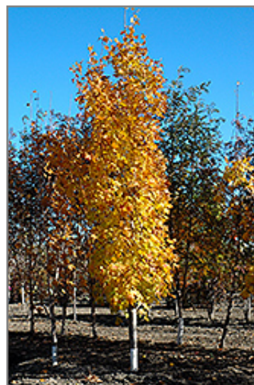
Lord Selkirk Sugar Maple in fall