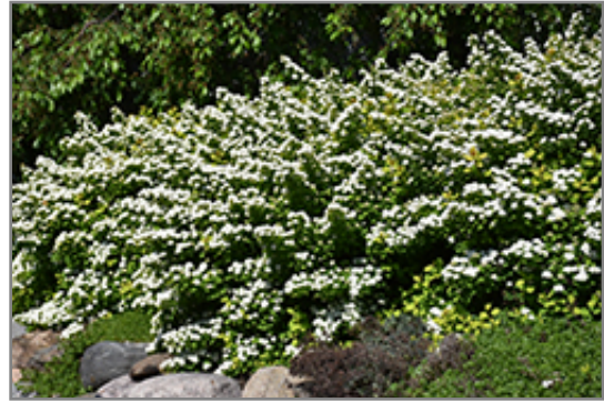
Glow Girl Birch Leaf Spirea in bloom