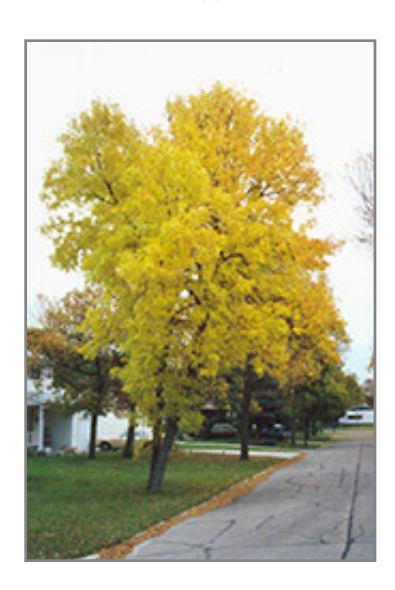
Green Ash in fall