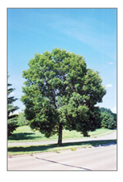
Green Ash