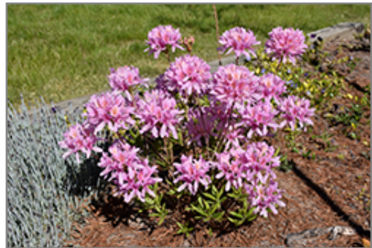
Orchid Lights Azalea in bloom