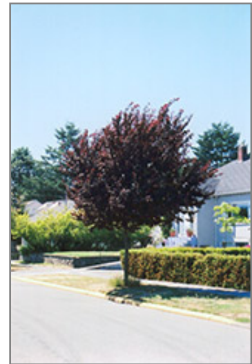
Newport Plum