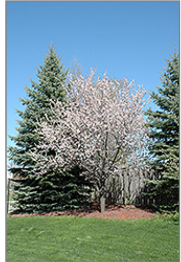
Newport Plum in bloom

* This is a 'special order' plant - contact store for details