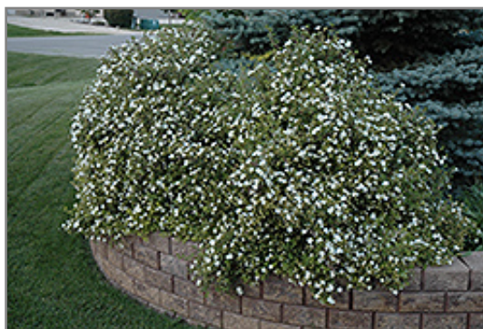
Abbotswood Potentilla in bloom