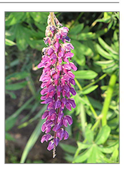
Common Lupine flowers

A stunning variety producing long spikes of eye catching violet and blue flowers; a tremendous visual impact massed in the garden, border plantings or containers