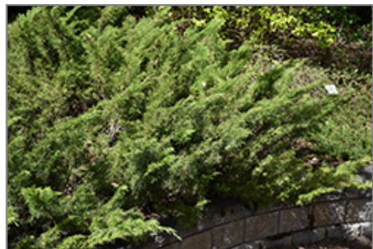
Skandia Juniper