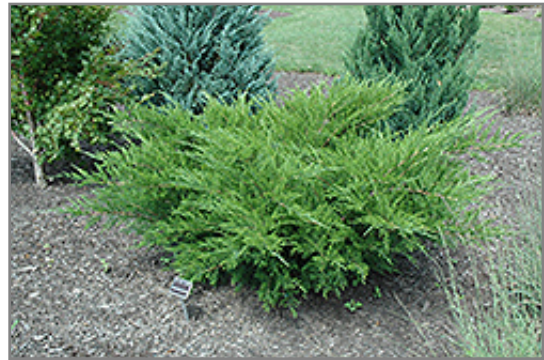
Sea Green Juniper