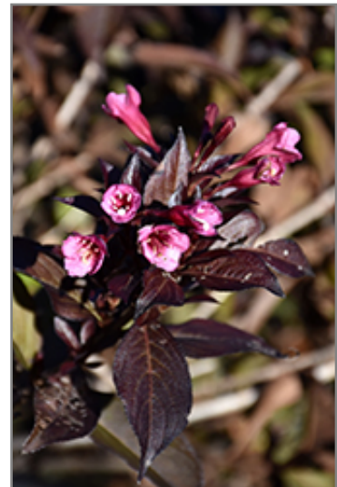
Fine Wine Weigela flowers