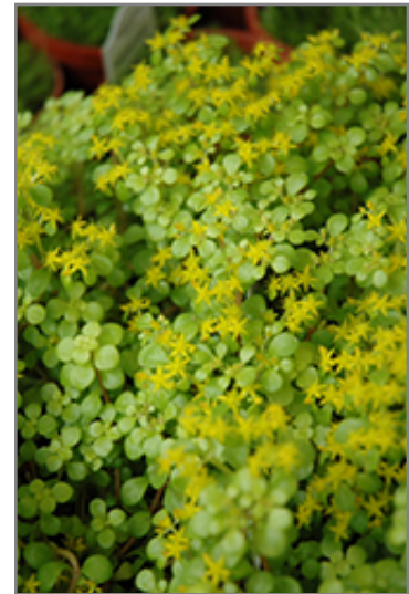
Golden Stonecrop flowers

This plant does best in full sun to partial shade. It prefers dry to average moisture levels with very well-drained soil, and will often die in standing water. It is considered to be drought-tolerant, and thus makes an ideal choice for a low-water garden or xeriscape application. It is not particular as to soil pH, but grows best in poor soils, and is able to handle environmental salt. It is highly tolerant of urban pollution and will even thrive in inner city environments. This is a selected variety of a species not originally from North America. It can be propagated by division; however, as a cultivated variety, be aware that it may be subject to certain restrictions or prohibitions on propagation.