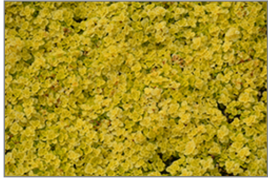
Golden Stonecrop foliage

Golden Stonecrop is recommended for the following landscape applications;