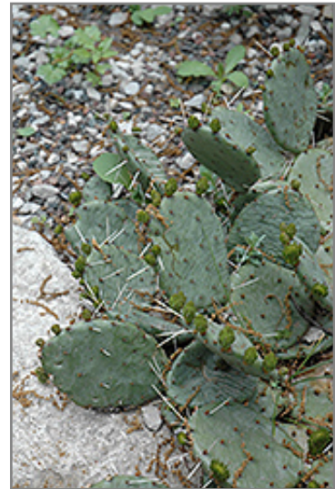
Eastern Prickly Pear Cactus