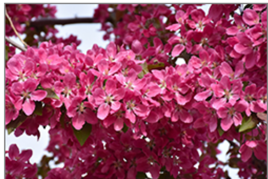
Big River Flowering Crab flowers