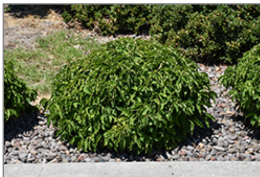
Kelsey Dogwood

Kelsey Dogwood is recommended for the following landscape applications;