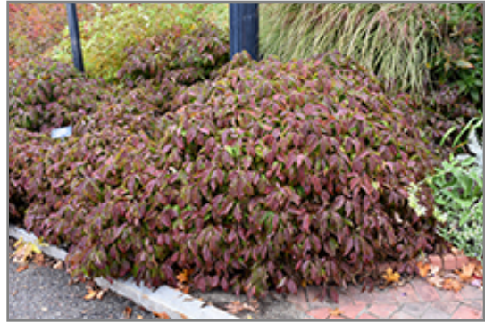
Kelsey Dogwood in fall

This shrub does best in full sun to partial shade. It is an amazingly adaptable plant, tolerating both dry conditions and even some standing water. It is not particular as to soil type or pH. It is highly tolerant of urban pollution and will even thrive in inner city environments. This is a selection of a native North American species.