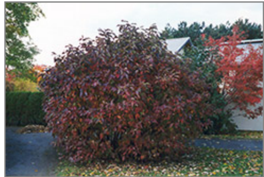
Siberian Dogwood in fall

* This is a 'special order' plant - contact store for details