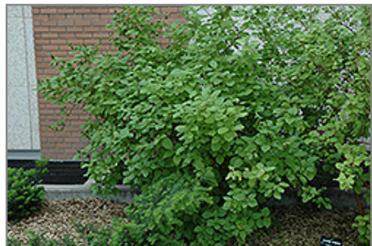
Siberian Dogwood