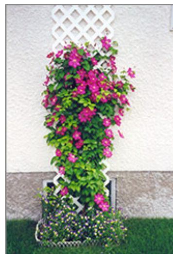
Ville de Lyon Clematis in bloom