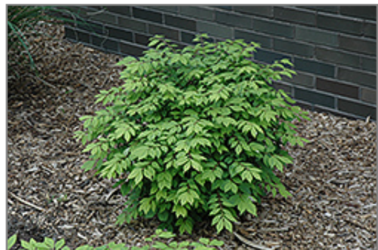
Little Moses Burning Bush