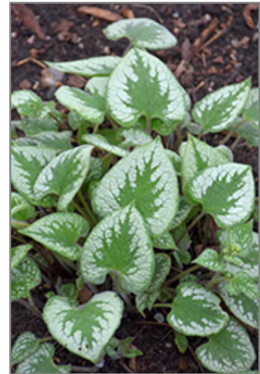
Emerald Mist Bugloss foliage

Emerald Mist Bugloss is a fine choice for the garden, but it is also a good selection for planting in outdoor pots and containers. It is often used as a 'filler' in the 'spiller-thriller-filler' container combination, providing a mass of flowers and foliage against which the thriller plants stand out. Note that when growing plants in outdoor containers and baskets, they may require more frequent waterings than they would in the yard or garden. Be aware that in our climate, most plants cannot be expected to survive the winter if left in containers outdoors, and this plant is no exception. Contact our experts for more information on how to protect it over the winter months.