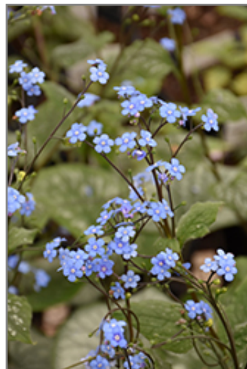
Emerald Mist Bugloss flowers