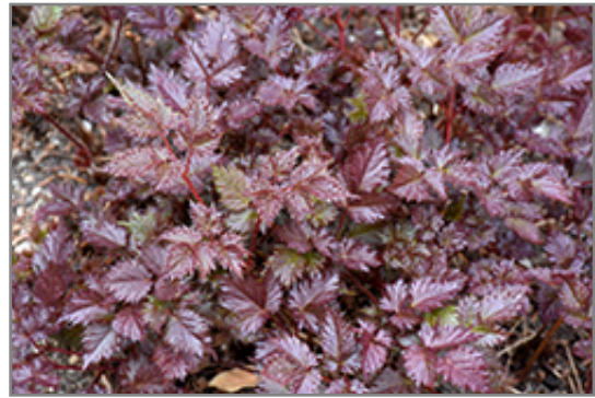
Delft Lace Astilbe foliage

Delft Lace Astilbe will grow to be about 16 inches tall at maturity extending to 24 inches tall with the flowers, with a spread of 12 inches. When grown in masses or used as a bedding plant, individual plants should be spaced approximately 12 inches apart. Its foliage tends to remain dense right to the ground, not requiring facer plants in front. It grows at a medium rate, and under ideal conditions can be expected to live for approximately 10 years. As an herbaceous perennial, this plant will usually die back to the crown each winter, and will regrow from the base each spring. Be careful not to disturb the crown in late winter when it may not be readily seen!