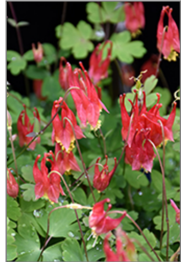
Little Lanterns Columbine flowers

Little Lanterns Columbine is a fine choice for the garden, but it is also a good selection for planting in outdoor pots and containers. It is often used as a 'filler' in the 'spiller-thriller-filler' container combination, providing a mass of flowers and foliage against which the larger thriller plants stand out. Note that when growing plants in outdoor containers and baskets, they may require more frequent waterings than they would in the yard or garden. Be aware that in our climate, most plants cannot be expected to survive the winter if left in containers outdoors, and this plant is no exception. Contact our experts for more information on how to protect it over the winter months.