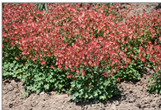
Little Lanterns Columbine in bloom