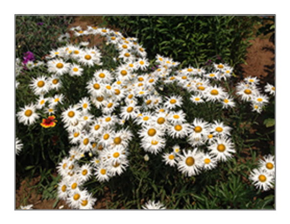
Crazy Daisy Shasta Daisy in bloom