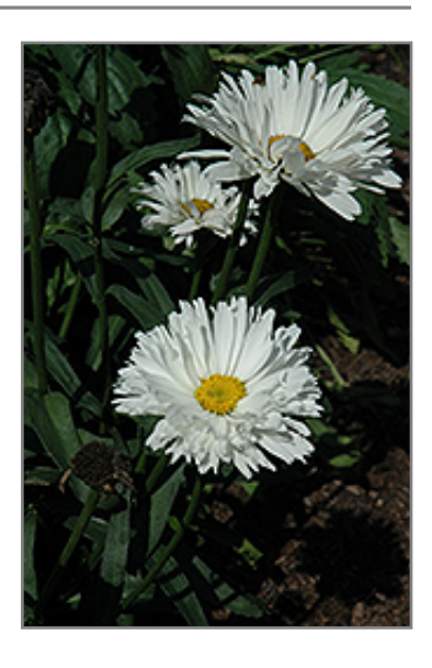
Crazy Daisy Shasta Daisy flowers