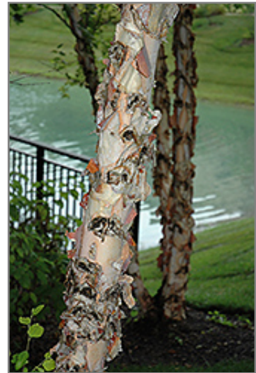
River Birch bark

River Birch will grow to be about 60 feet tall at maturity, with a spread of 45 feet. It has a low canopy with a typical clearance of 3 feet from the ground, and should not be planted underneath power lines. It grows at a fast rate, and under ideal conditions can be expected to live for 70 years or more.