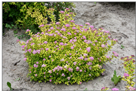
Sundrop Spirea in bloom