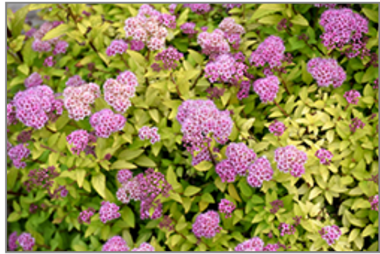
Sundrop Spirea flowers