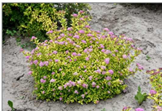
Sundrop Spirea in bloom