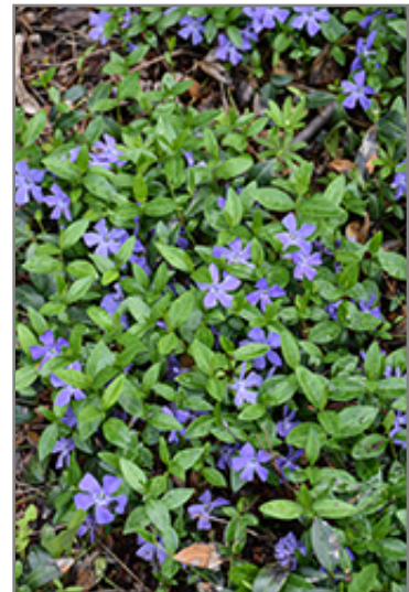
Common Periwinkle flowers