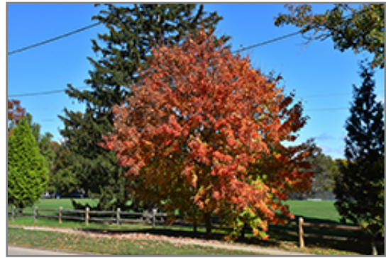
Ruby Frost Red Maple in fall