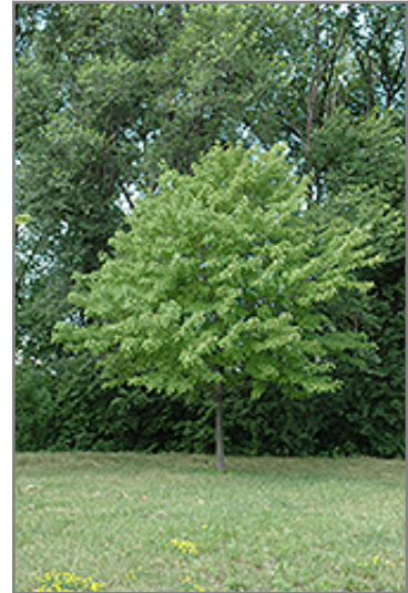
Ruby Frost Red Maple

* This is a 'special order' plant - contact store for details