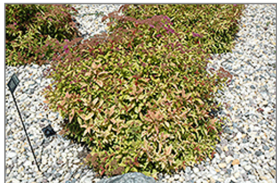
Flaming Mound Spirea