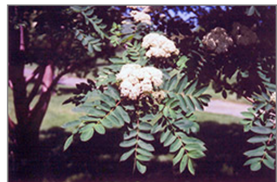
Showy Mountain Ash flowers