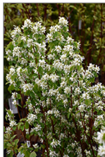
Standing Ovation Saskatoon Berry flowers