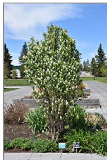
Standing Ovation Saskatoon Berry in bloom