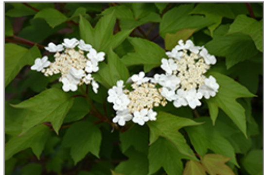
Redwing Highbush Cranberry flowers

Redwing Highbush Cranberry is a dense multi-stemmed deciduous shrub with an upright spreading habit of growth. Its average texture blends into the landscape, but can be balanced by one or two finer or coarser trees or shrubs for an effective composition.