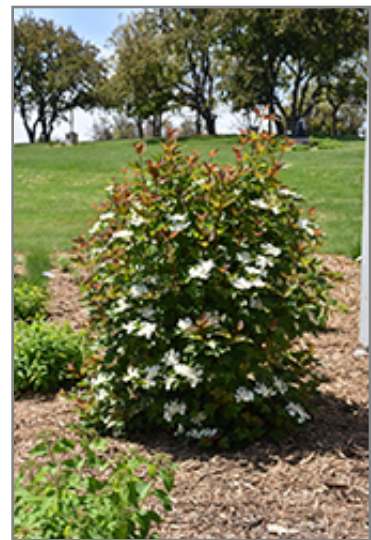
Redwing Highbush Cranberry in bloom