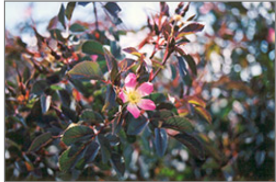
Red Leaf Rose flowers