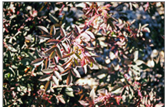
Red Leaf Rose foliage