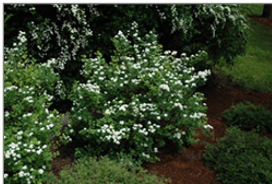
Tor Spirea in bloom