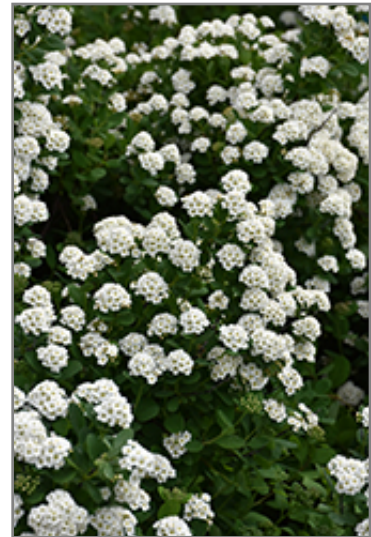
Tor Spirea flowers

This shrub should only be grown in full sunlight. It prefers to grow in average to moist conditions, and shouldn't be allowed to dry out. It is not particular as to soil type or pH. It is highly tolerant of urban pollution and will even thrive in inner city environments. This is a selected variety of a species not originally from North America.