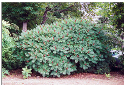
Smooth Sumac in bloom