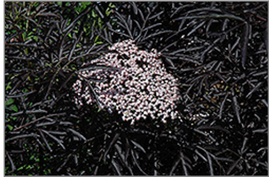
Black Lace Elder flowers

* This is a 'special order' plant - contact store for details