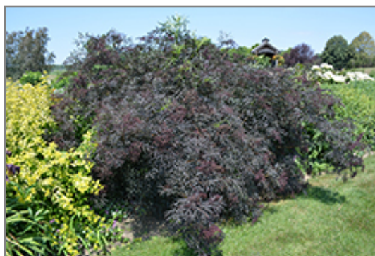
Black Lace Elder