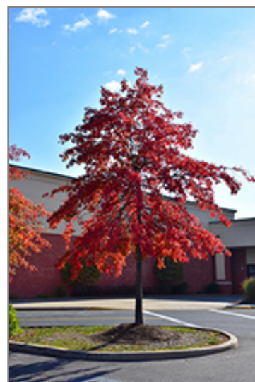
Pin Oak in fall