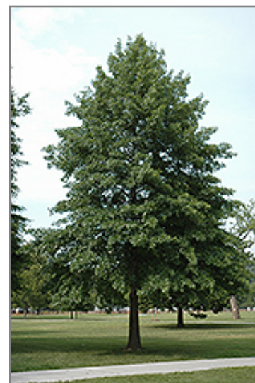
Pin Oak