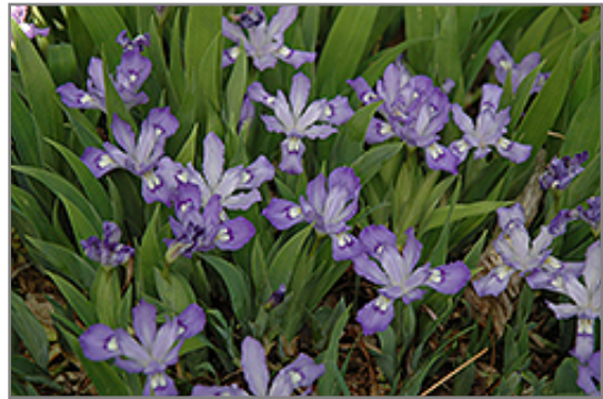
Dwarf Crested Iris flowers