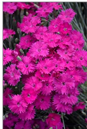
Neon Star Pinks flowers

Neon Star Pinks is recommended for the following landscape applications;