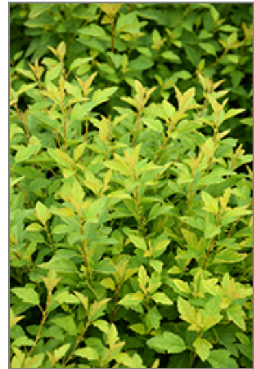
Raspberry Lemonade Ninebark foliage