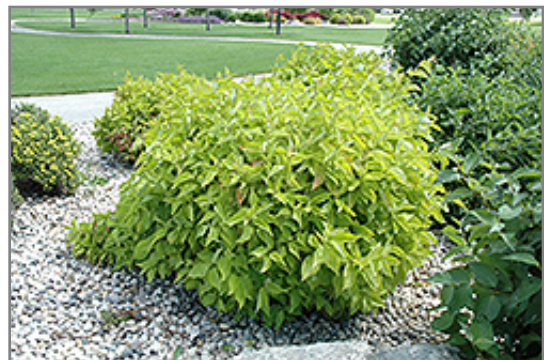
Prairie Fire Dogwood