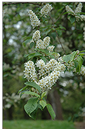
Mayday flowers