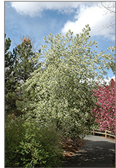
Mayday in bloom

* This is a 'special order' plant - contact store for details