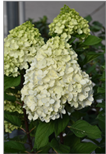
Little Lime Punch Hydrangea flowers