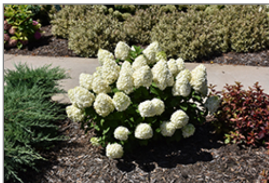
Little Lime Punch Hydrangea in bloom

* This is a 'special order' plant - contact store for details