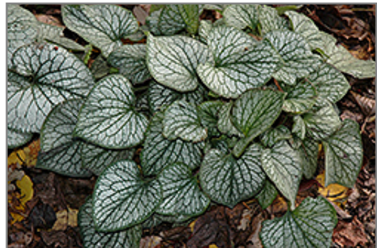
Jack Frost Bugloss foliage