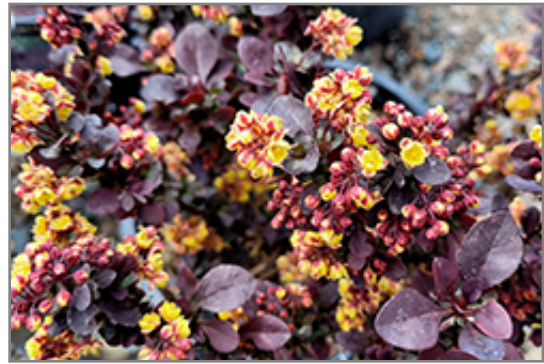
Concorde Japanese Barberry flowers

Concorde Japanese Barberry will grow to be about 18 inches tall at maturity, with a spread of 24 inches. It tends to fill out right to the ground and therefore doesn't necessarily require facer plants in front. It grows at a slow rate, and under ideal conditions can be expected to live for approximately 20 years.